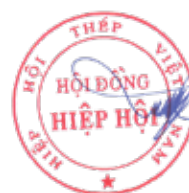
NGHIEM XUAN DA